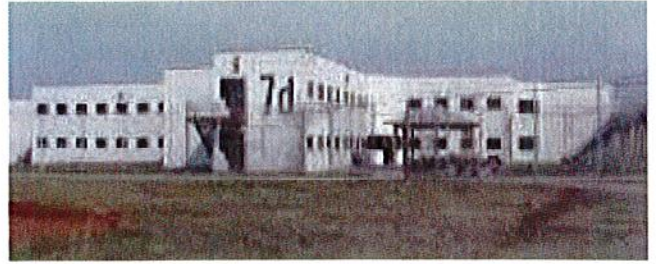
Example of a Inmate Housing Unit at LLCC

LLCC is accredited by the American Correctional Association (ACA).