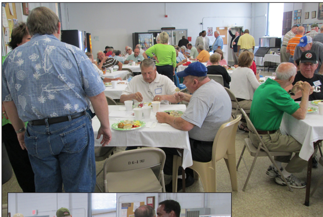
Retirees Invited to Breakfast to Hear About the Program