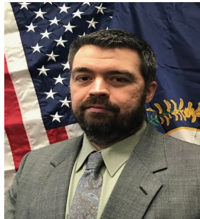
Instructor/ Coordinator I