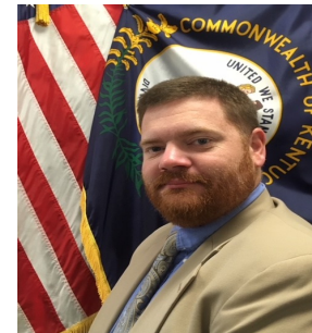
Instructor/ Coordinator II