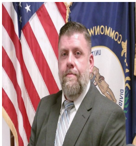
Instructor/ Coordinator I