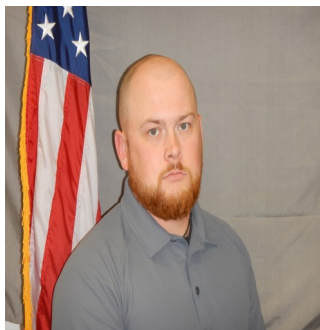
Instructor/ Coordinator I