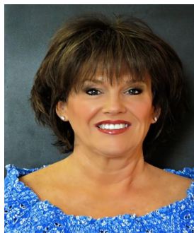
Administrative Specialist II