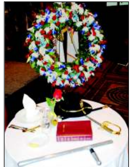
A table filled with items to honor all fallen correctional officers was displayed throughout the CPOF Conference.

The conference was held in conjunction with the CPOF Annual National Memorial Ceremony to honor fallen Correctional Peace Officers.