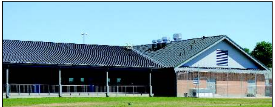
NTC's new multi-purpose building that houses the food service department with a modern kitchen and two dining rooms, a library, the academic school, the medical and dental offices.

Within 24 hours of the disturbance, 700 inmates were transferred from NTC